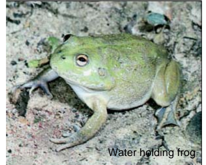
Water holding frog

The water holding frog has special sacs in its body that store the water it will need during that time. The painted burrowing frog sheds its skin. This skin forms a bag or cocoon around the frog's body that keeps the moisture in until the rain comes. When it rains, both frogs come to the surface, then quickly mate, lay, and hatch their eggs before the ground dries up again."