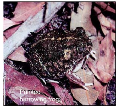
Painted burrowing frog